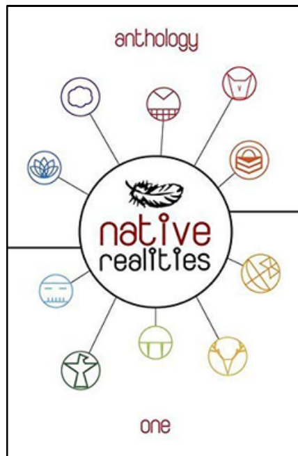
Native Realities Anthology, One