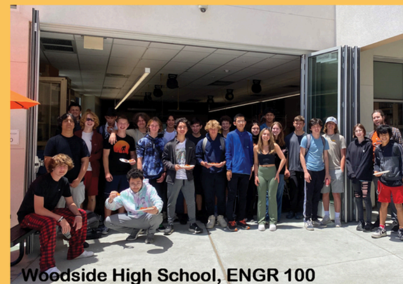
Woodside High School, ENGR 100

"Dual Enrollment courses are beneficial to high school students wanting to earn credit for high school and college credit. Other than raising my own 3 teenagers, teaching dual enrollment courses to high school students has been an awakening."