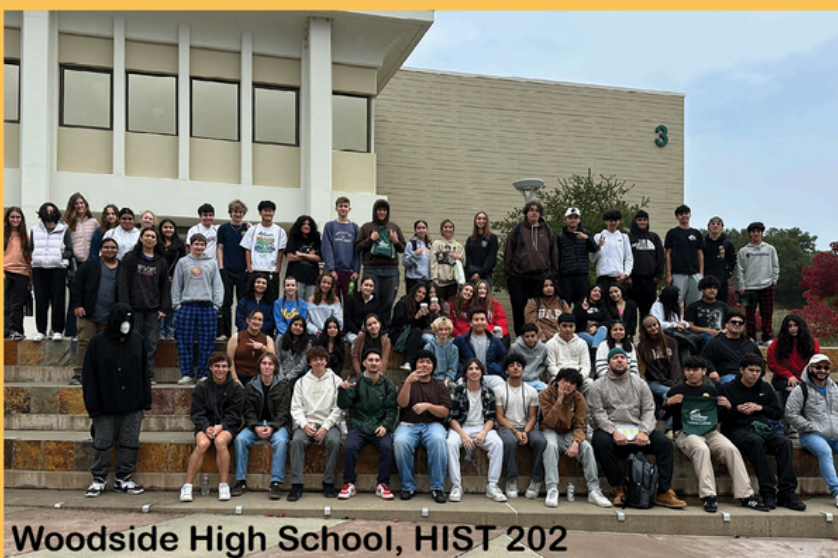
Woodside High School, HIST 202