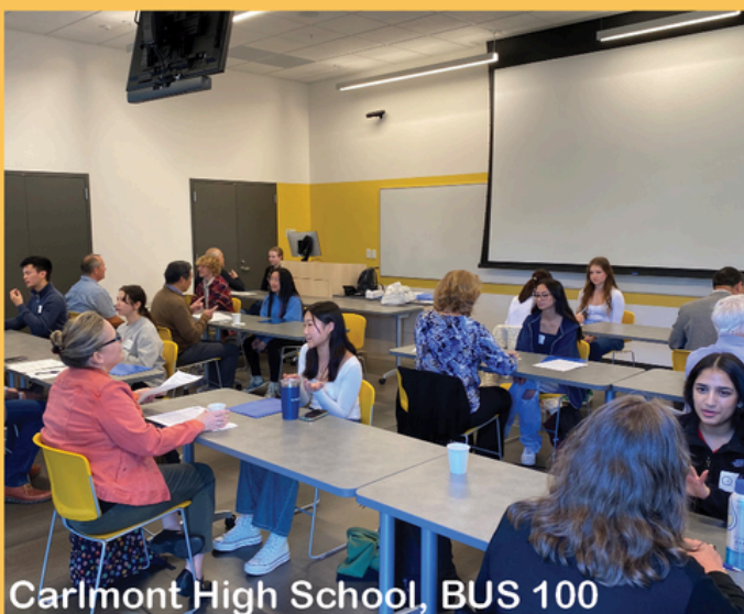
Carlmont High School, BUS 100