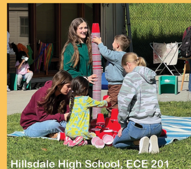
Hillsdale High School, ECE 201