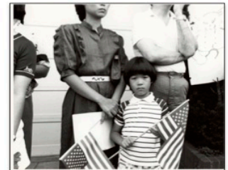
(Image: Boy with American Flag in San Francisco, late 70s )